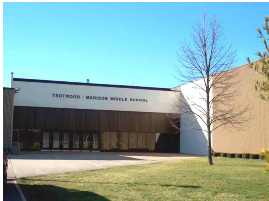
Trotwood-Madison Middle School