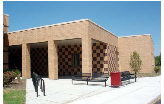
Madison Park Elementary School