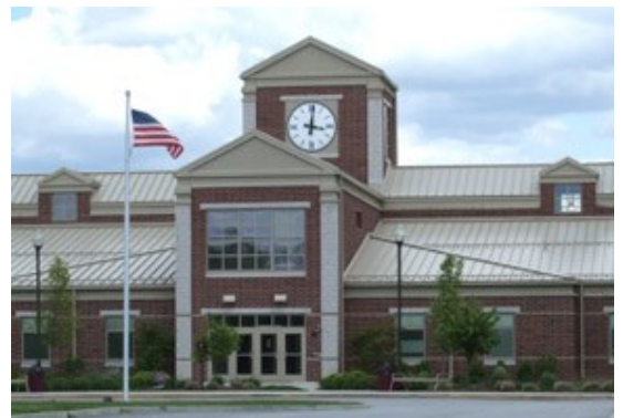
Trotwood-Madison High School